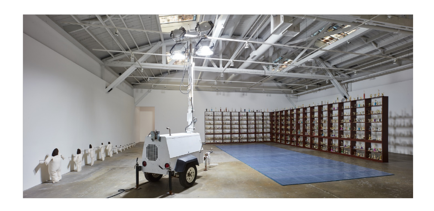
Figure 3.1. Diamond Stingily, Tower Light , 2017. Installation view at California College of the Arts, Wattis Institute for Contemporary Art. Modified light tower, 152" x 110" x 50".