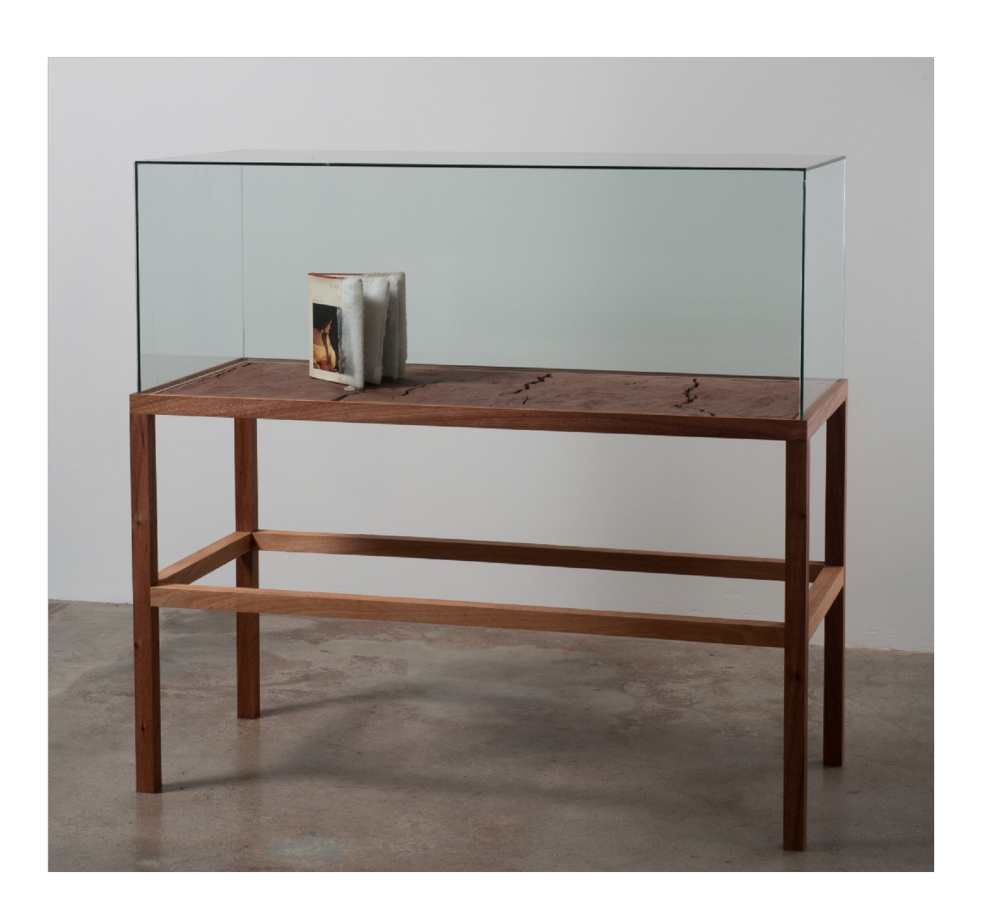
Figure 2.1. Edgar Arceneaux, Orpheum Returns-Fire's Creation , 2010. Installation interior view.