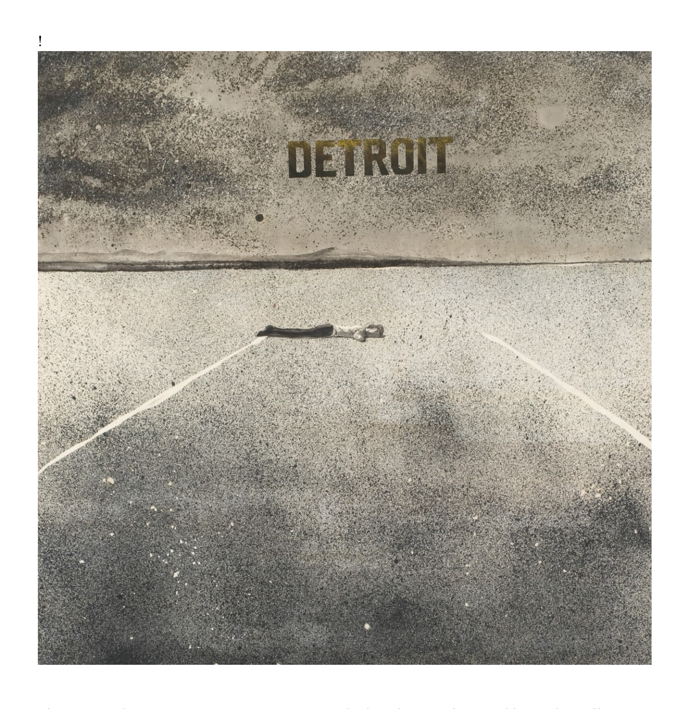
Figure I.1. Edgar Arceneaux, Detroit , 2009. Synthetic polymer paint, graphite, and pencil on paper, 73 x 61 in.