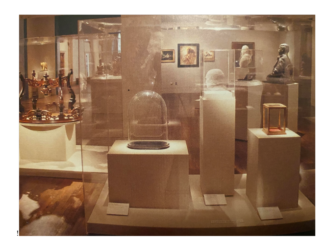
Figure I.2. Fred Wilson, Speaking in Tongues: A Look at the Languages of Display , 1998. De Young Museum, San Francisco.