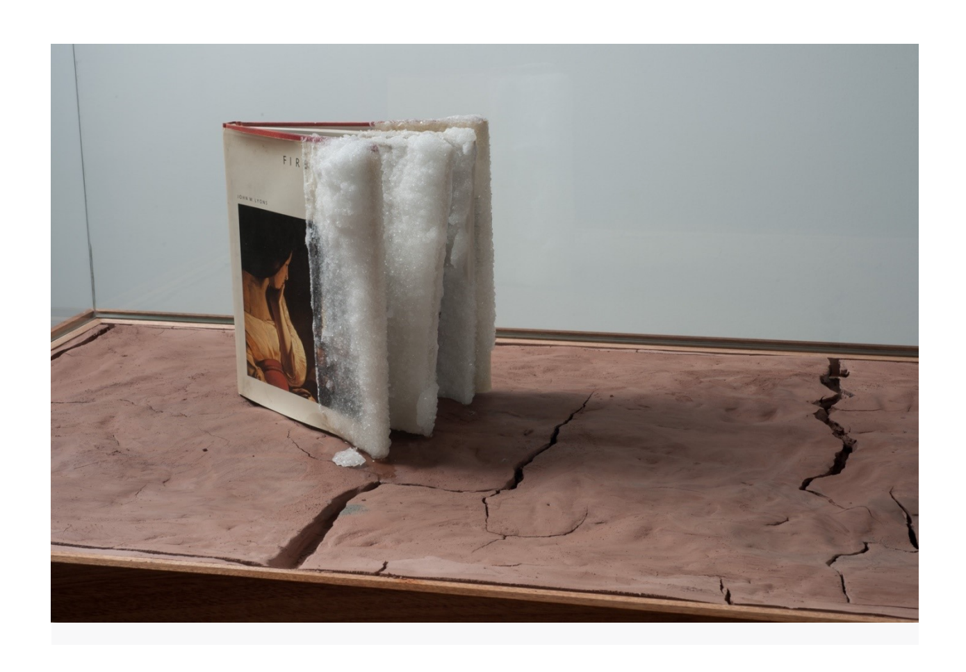
Figure 2.2. Edgar Arceneaux, Orpheum Returns–Fire's Creation 2010. Detail showing the cover for John W. Lyons' Fire (1985) featuring a reproduction of Georges de La Tour's The Repentant Magdalene , c. 1640.