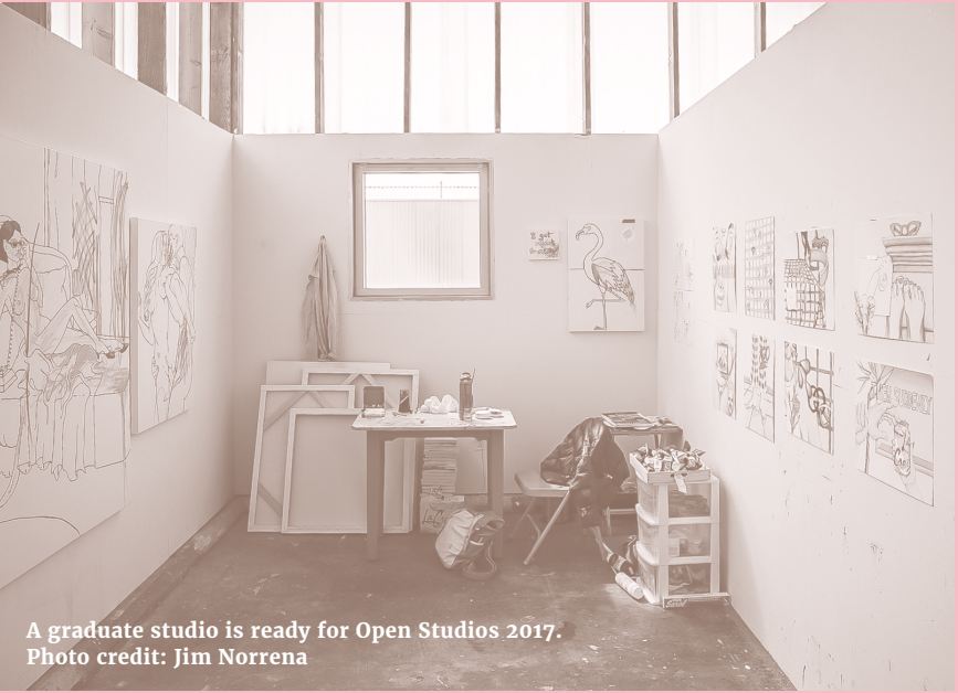
A graduate studio is ready for Open Studios 2017.