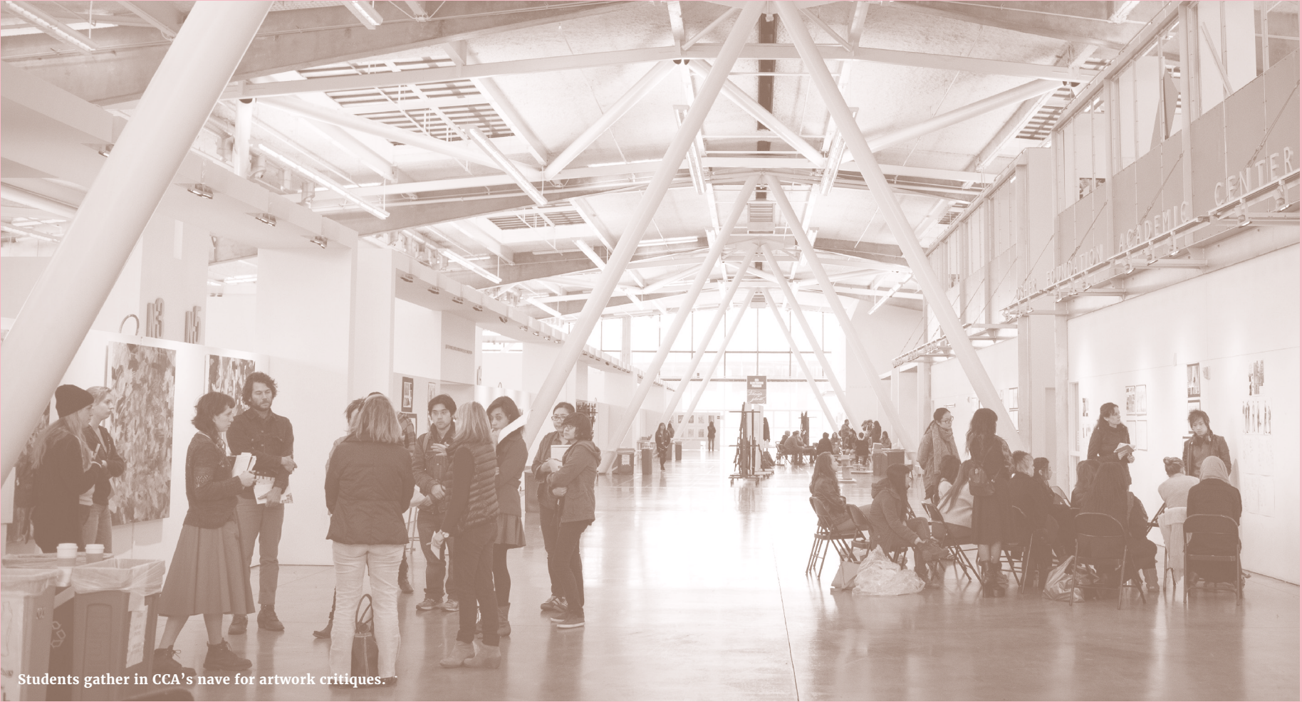
Students gather in CCA's nave for artwork critiques.