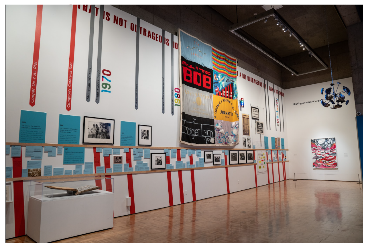
Fig. 1. Installation View, Queer California: Untold Stories.