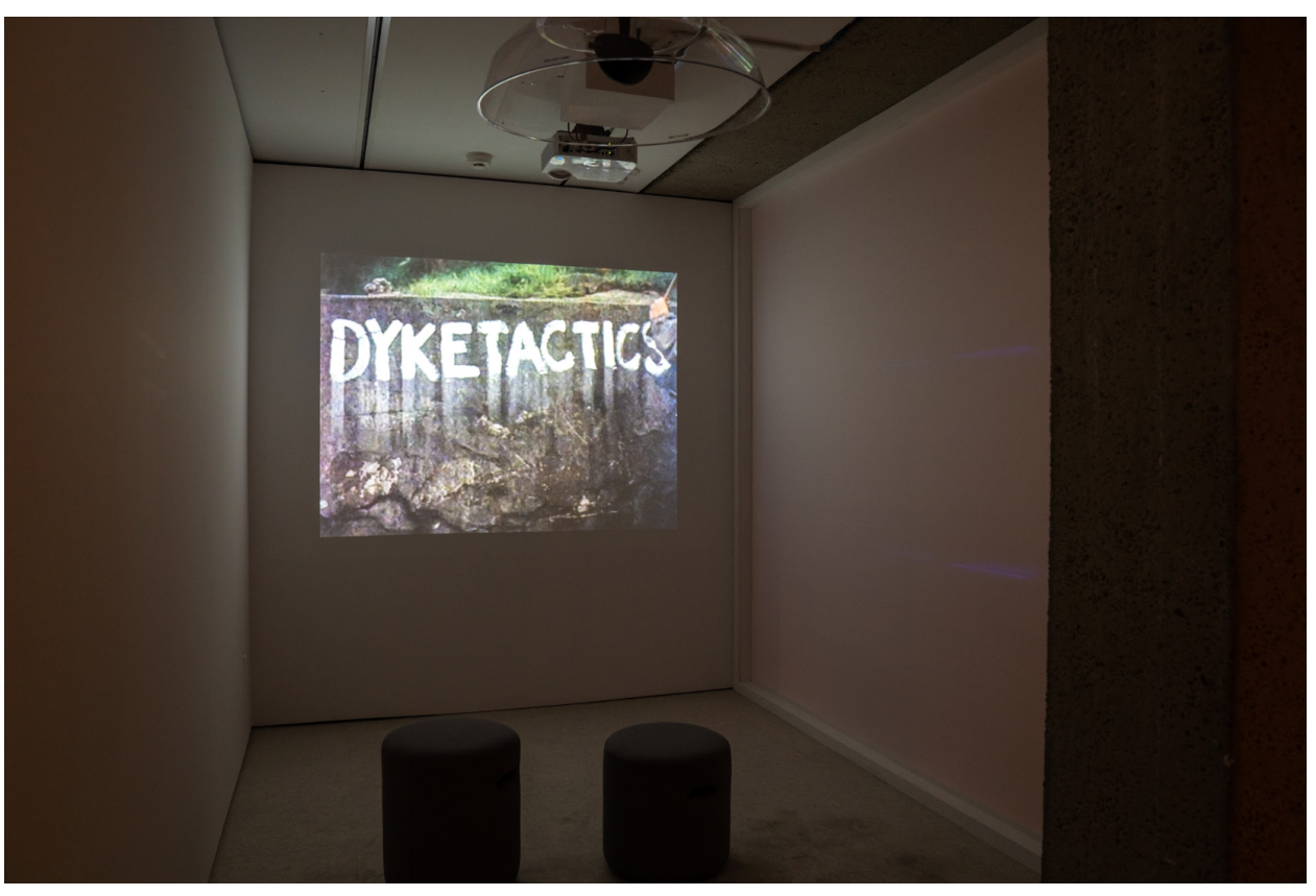
Fig. 10. Barbara Hammer, Dyketactics (1974), 16mm film, Color/Sound, 4 min.