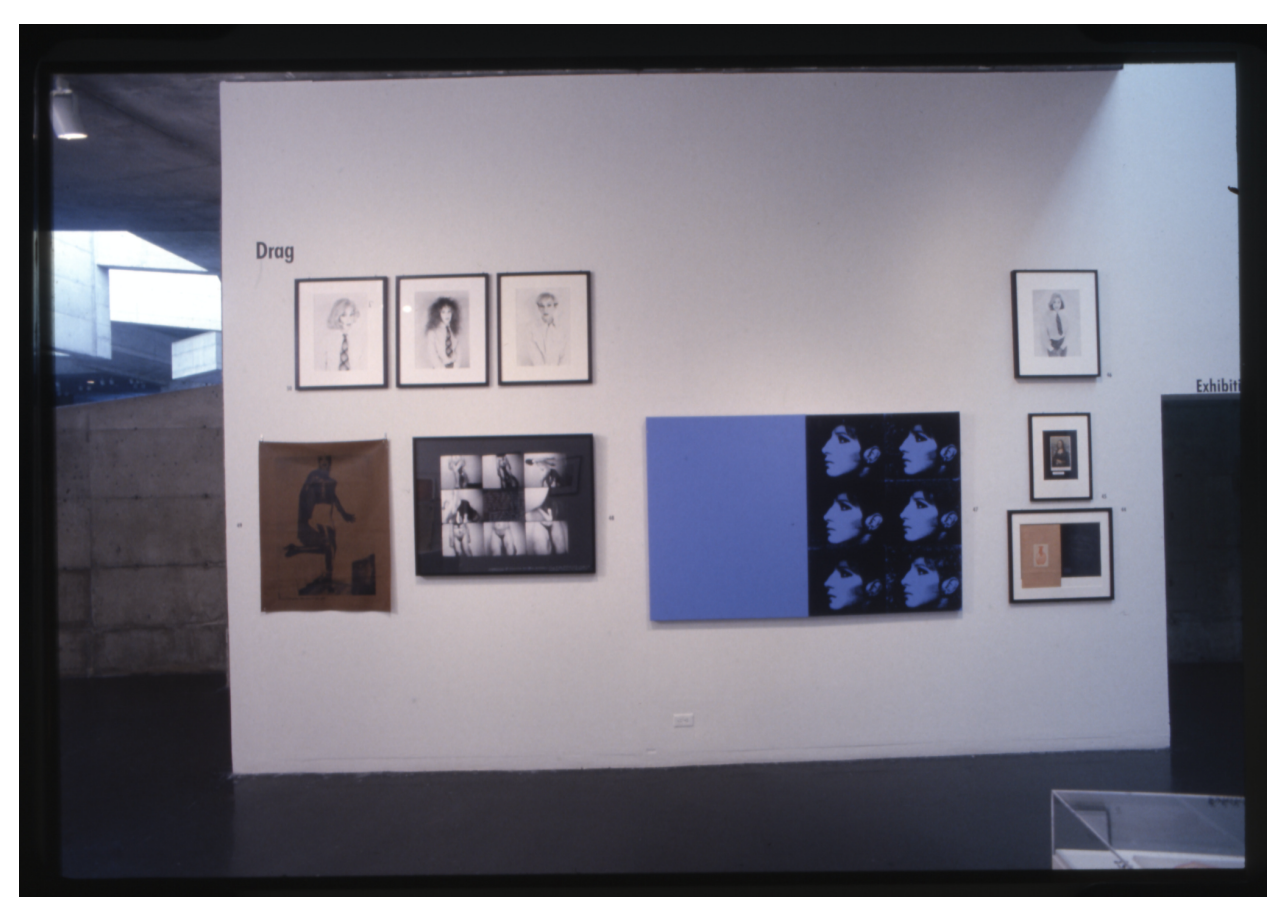
Fig. 5. Installation View of Drag Section, In A Different Light .