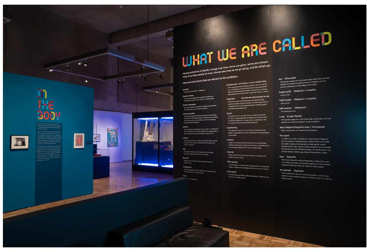
Fig. 12. Installation View, Queer California: Untold Stories.