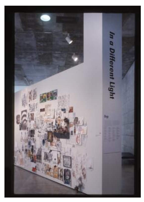
Fig. 2. Installation view of Orgy section, In A Different Light , Photo courtesy of Berkeley Art Museum and Pacific Film Archive.