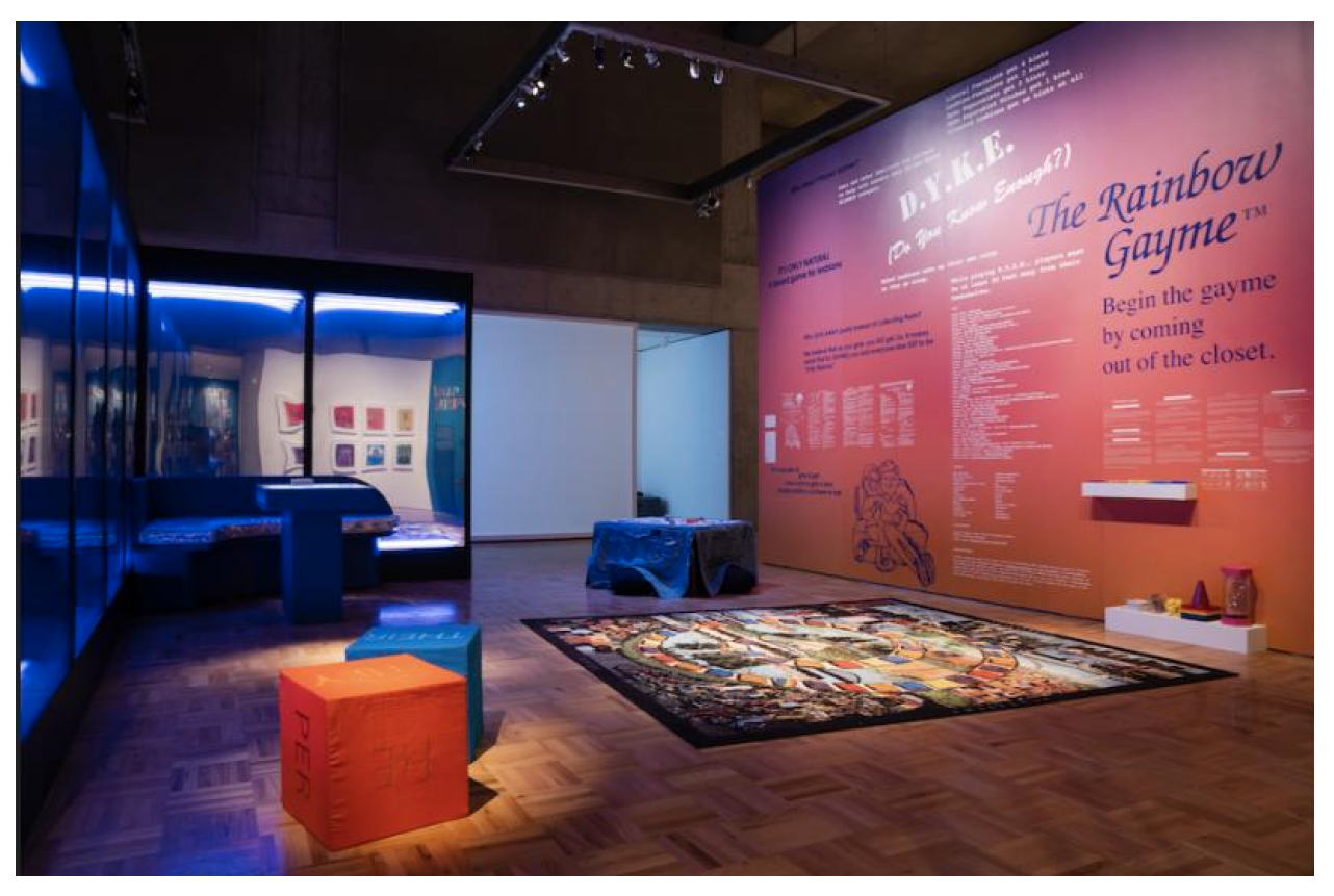
Fig. 13. Installation View, Queer California: Untold Stories .