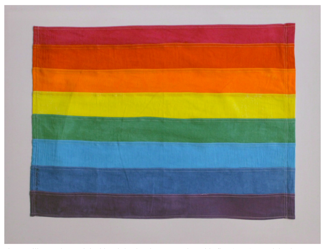
Fig. 7. Gilbert Baker, Original hand-dyed and sewn 8-color pride flag (1978), Hand dyed, screen printed, and sewn fabric: powdered-coated.