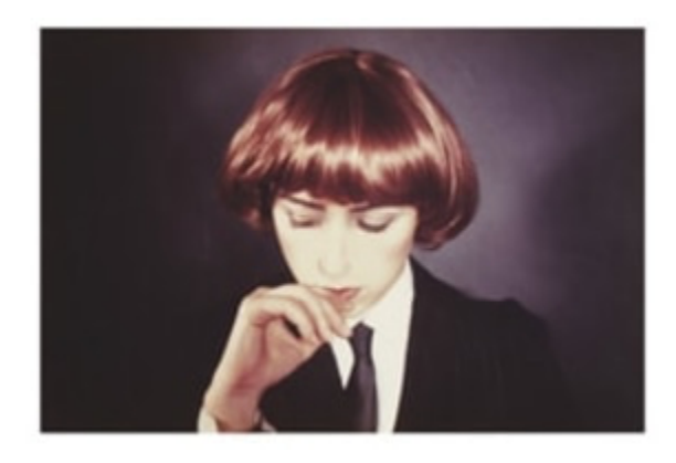
Fig. 3. Richard Prince and Cindy Sherman, Untitled (Richard Prince and Cindy Sherman) (1980), Set of two Ektacolor photographs, 20 x 24 in each.