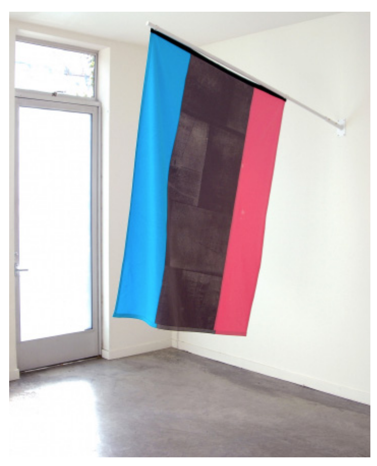
Fig. 8. Amanda Curreri, Misfits 1979 (Sex and Art) (2013), Hand-dyed, screen-printed, sewn fabric. Photo courtesy of Amanda Curreri.