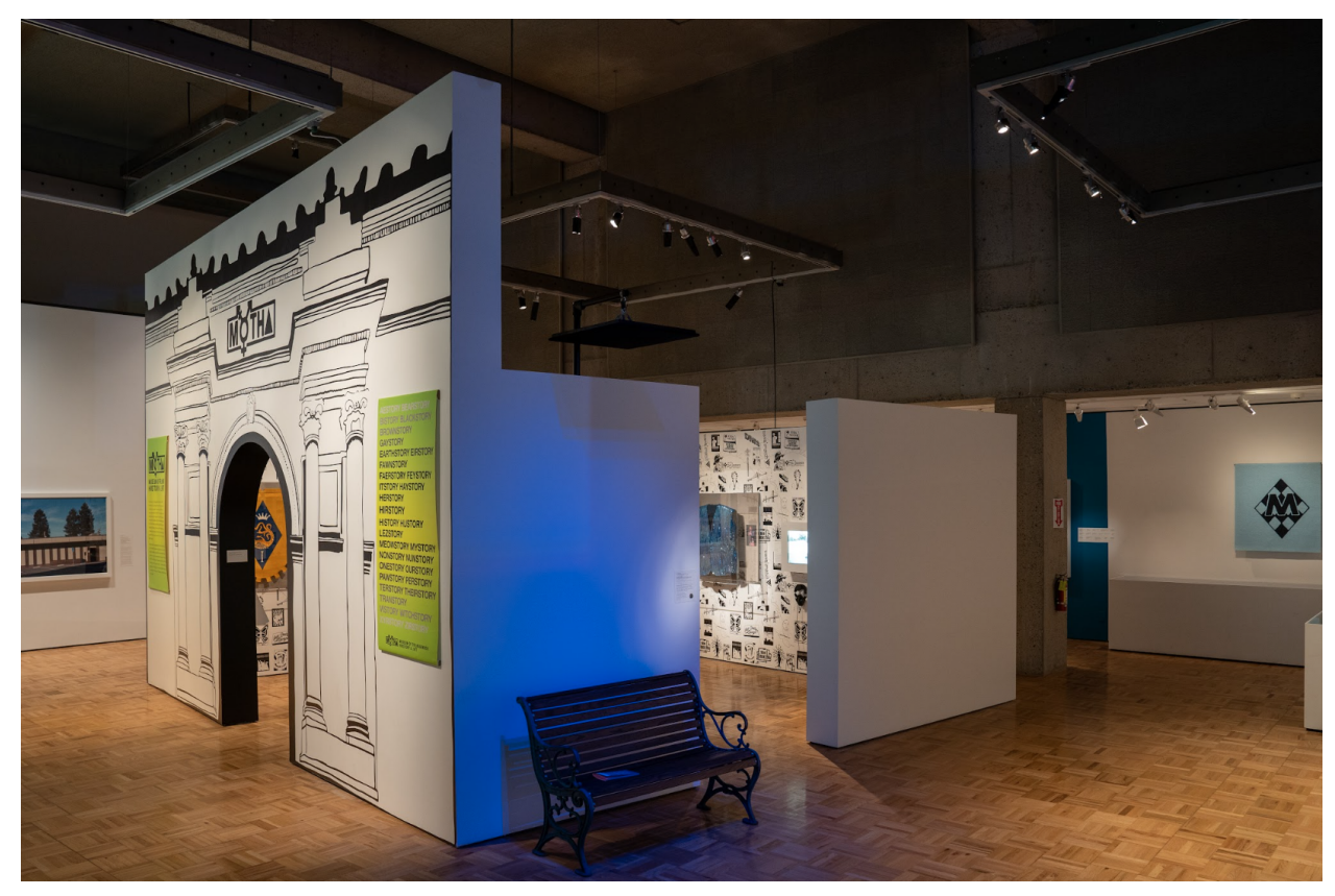
Fig. 15. Installation view, Kate Clark Queen's Circle: Cruising Oral Histories of Balboa Park (2016/2019).