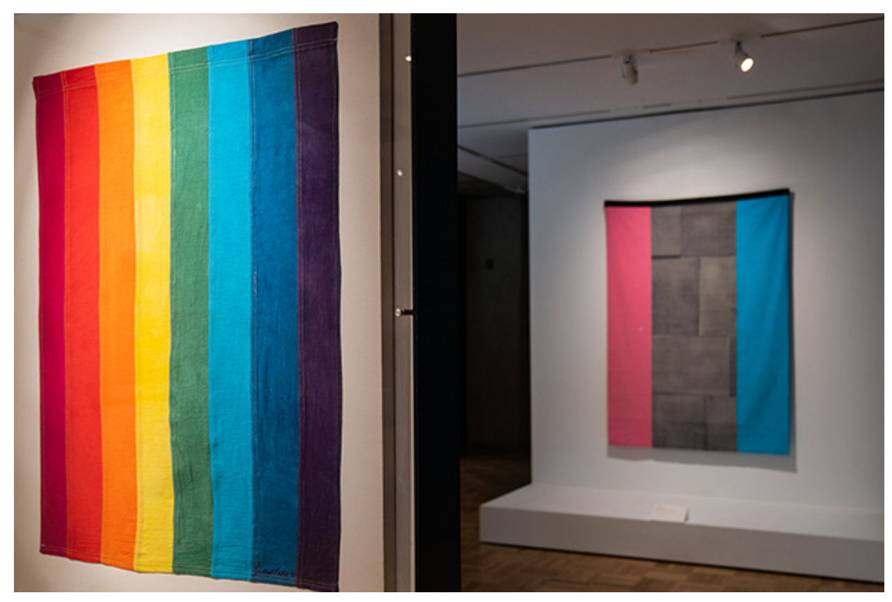
Fig. 6. Installation view, (left to right) Gilbert Baker, Original hand-dyed and sewn 8-color pride flag (1978) and Amanda Curreri, Misfits 1979 (Sex and Art) (2013).