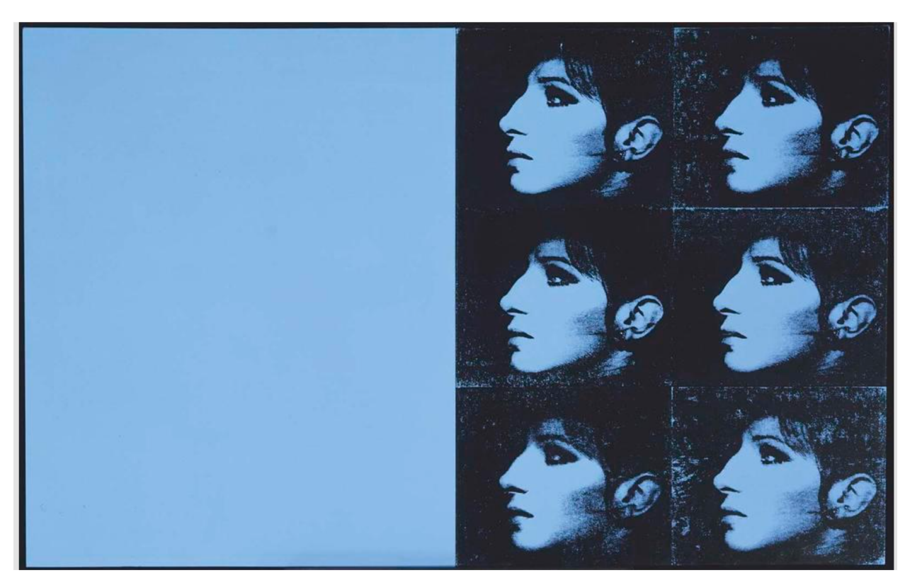
Fig. 4. Deborah Kass, Double Blue Barbra (The Jewish Jackie Series) (1992), Silkscreen ink on synthetic polymer paint on canvas, 36 x 45 in.