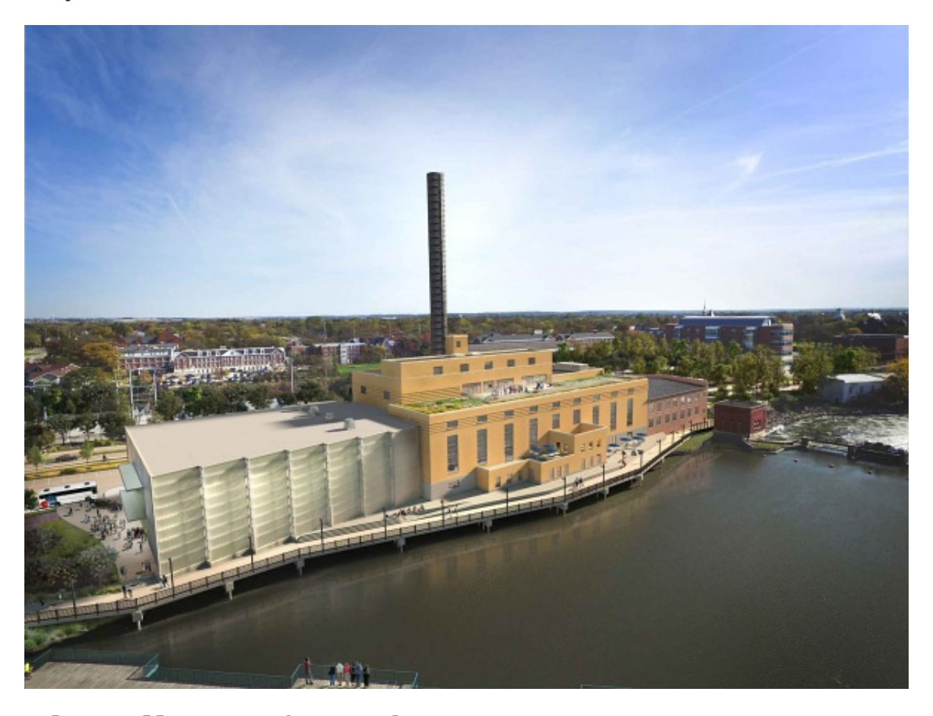
Beloit College Powerhouse Beloit, WI, 2019