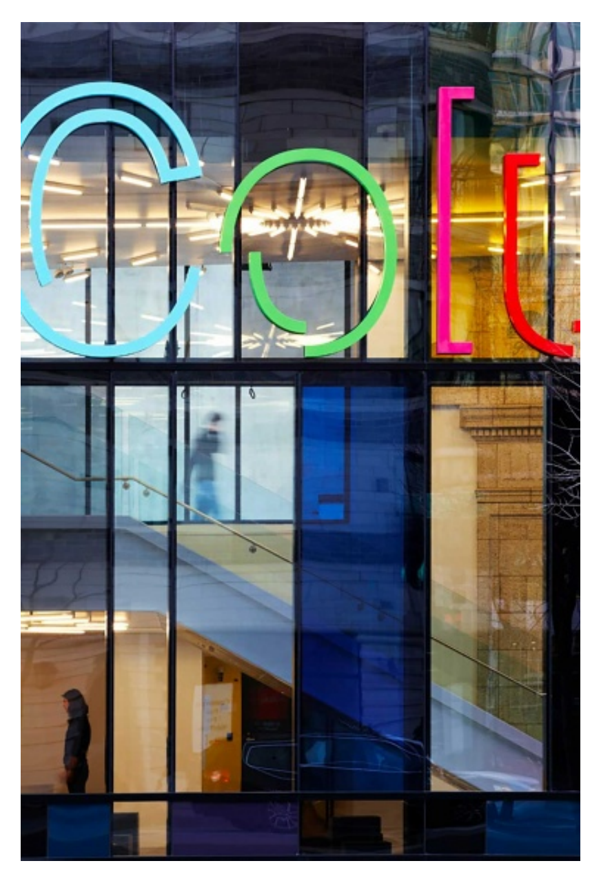
Columbia College Chicago Media Production Center Chicago, 2010