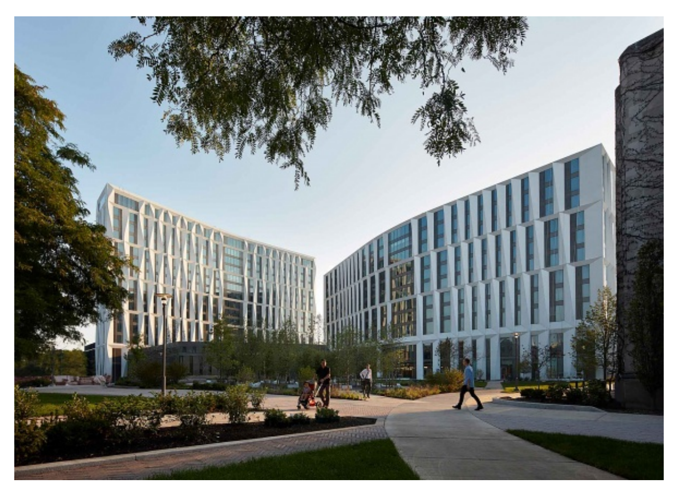
University of Chicago Campus North Residential Commons Chicago, 2016