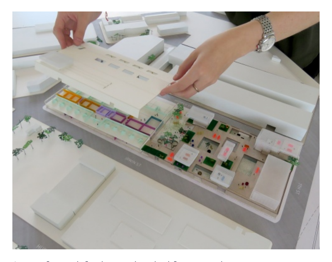
An early model shows the double ground concept.

Together, this layered environment functions as a laboratory where students and faculty can explore materials, processes, and tools. Incorporating passive strategies and sustainable systems allows the campus to function as a closed-loop, net-positive system, supporting healthy, progressive spaces for art making and ensuring resiliency for the future. Tied into the city's design and innovation district, the campus provides public amenities and green spaces for the greater community benefit, seeking to be an exemplary neighbor during the continued growth of its neighborhood.