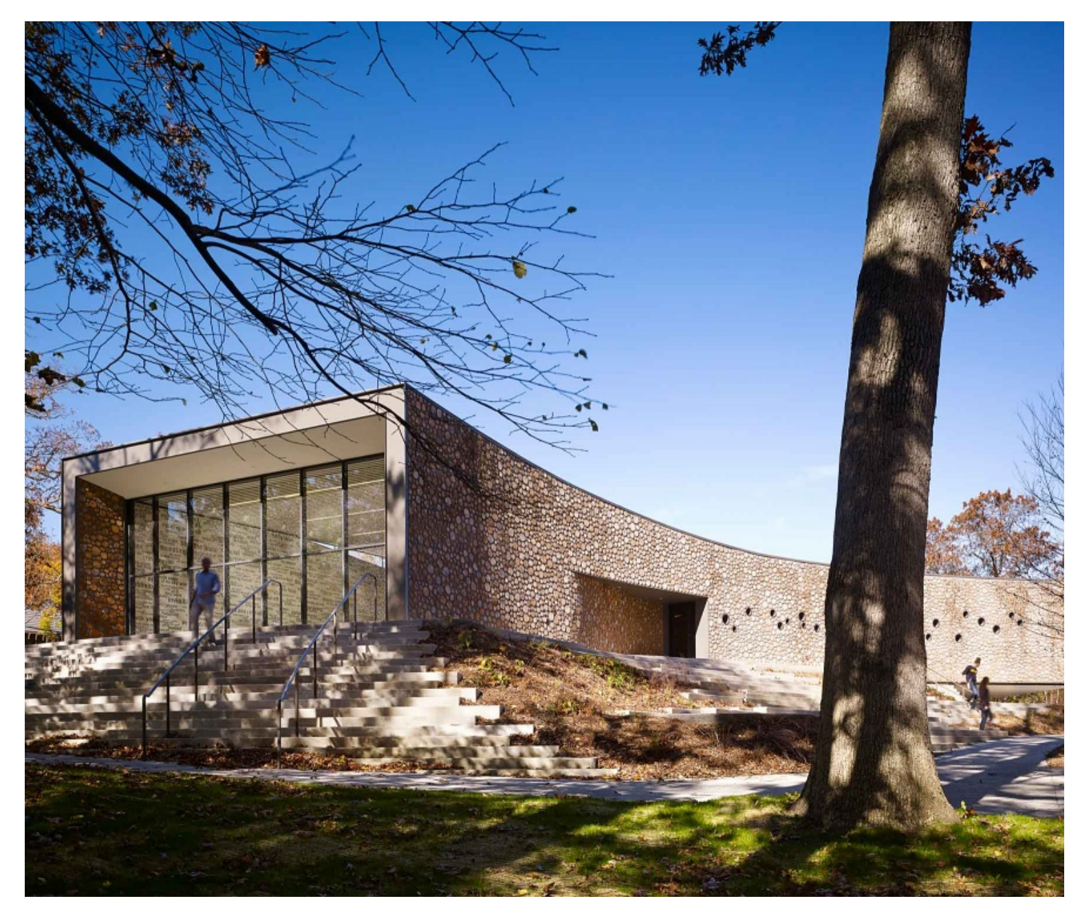
Arcus Center for Social Justice Leadership Kalamazoo, MI, 2014