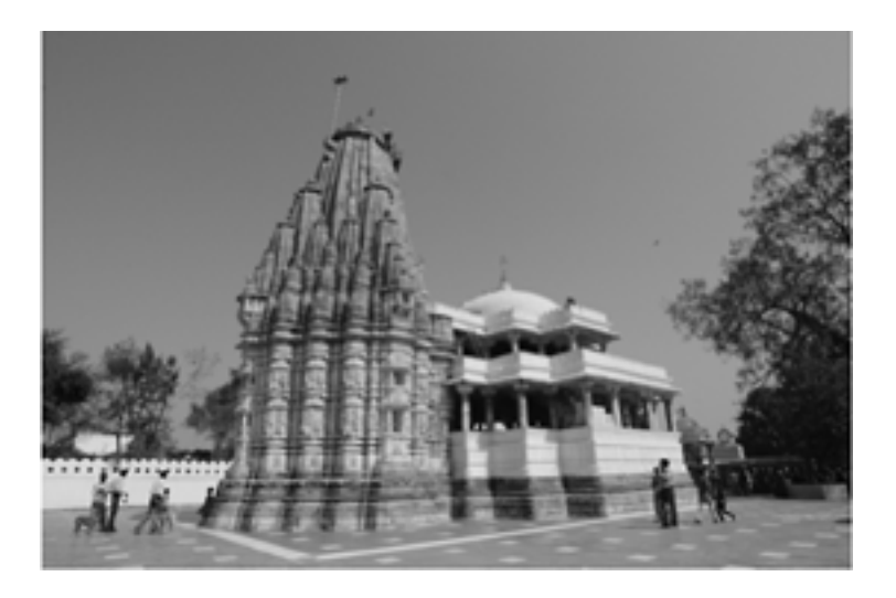
Figure 13 Jawar Mata Temple, Jawar, Rajasthan.

of the most important Mewari kings. In fact, the Jawar Mata temple records a relationship without which Mewar may not have been able to remain as independent as it did for as long as it did.