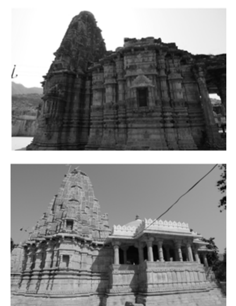
Figure 12 Ramanatha Temple, Jawar, Rajasthan. © Deborah Stein.

Ruined Temple 3, Jawar, Rajasthan. © Deborah Stein.