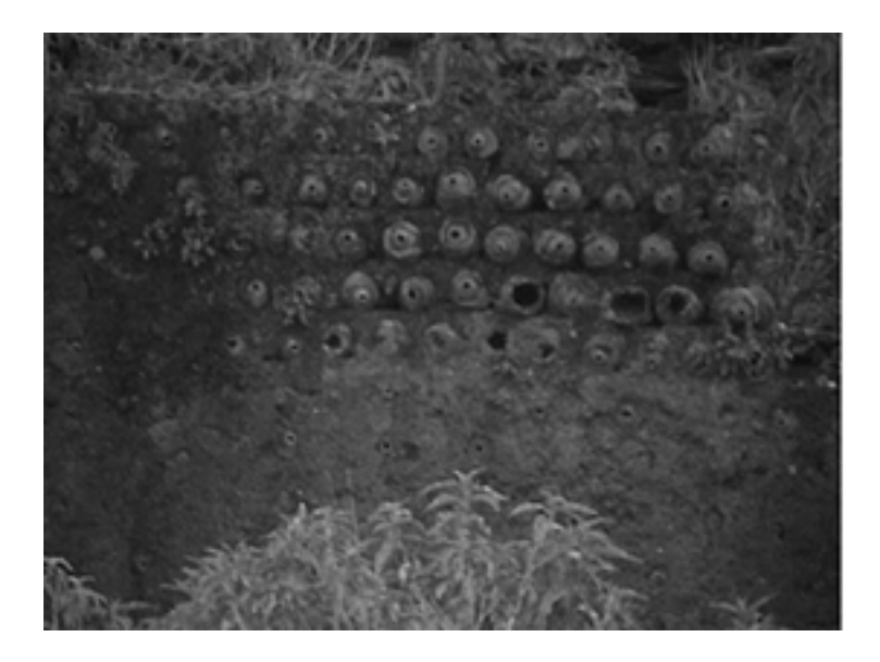
Figure 14 Zinc smelters, c. 1397, Jawar, Rajasthan.