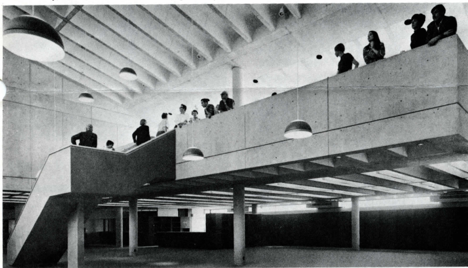
Before the furniture arrived, alumni visitors viewed the airy heights of the spacious library

What next? Already begun—almost an anticlimax—is a new sculpture building. Will wonders never cease?