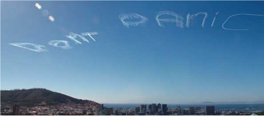
"Don't Panic," 2005, by Ruth Sacks. Photographic documentation of skywriting in Cape Town, South Africa.

This is where language is alive and takes into account the live other. It may falter, slip into silence or gibberish, but it's sounding out the new cultural attention to a very old, complex relationship to habitat.