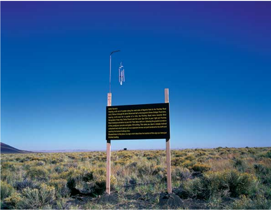
“Better Scenery, 2000,” by Adam Chodzko, presents language in the landscape, but it refers to elsewhere. Here in the Painted Desert, the reader finds directions from central London to another sign in the O2 shopping center car park. The wind chime atop the sign alerts the reader’s body to here.

These language-ecosystem collisions occur in a field overgrown with desire and escapist fantasy. In “Better Scenery, 2001,” signs are located outside a car factory in Turin and in a forest in Cumbria, England. In “Better Scenery, 2002,” the signs are in a field in Fargo, North Dakota, and in the branches of a tree outside Cubitt Gallery, London. These language-ecosystem collisions occur in a field overgrown with desire and escapist fantasy. In another project, Chodzko placed a pencil drawing of a forest in a sex-contact magazine with the words, “Please will you join me here?”