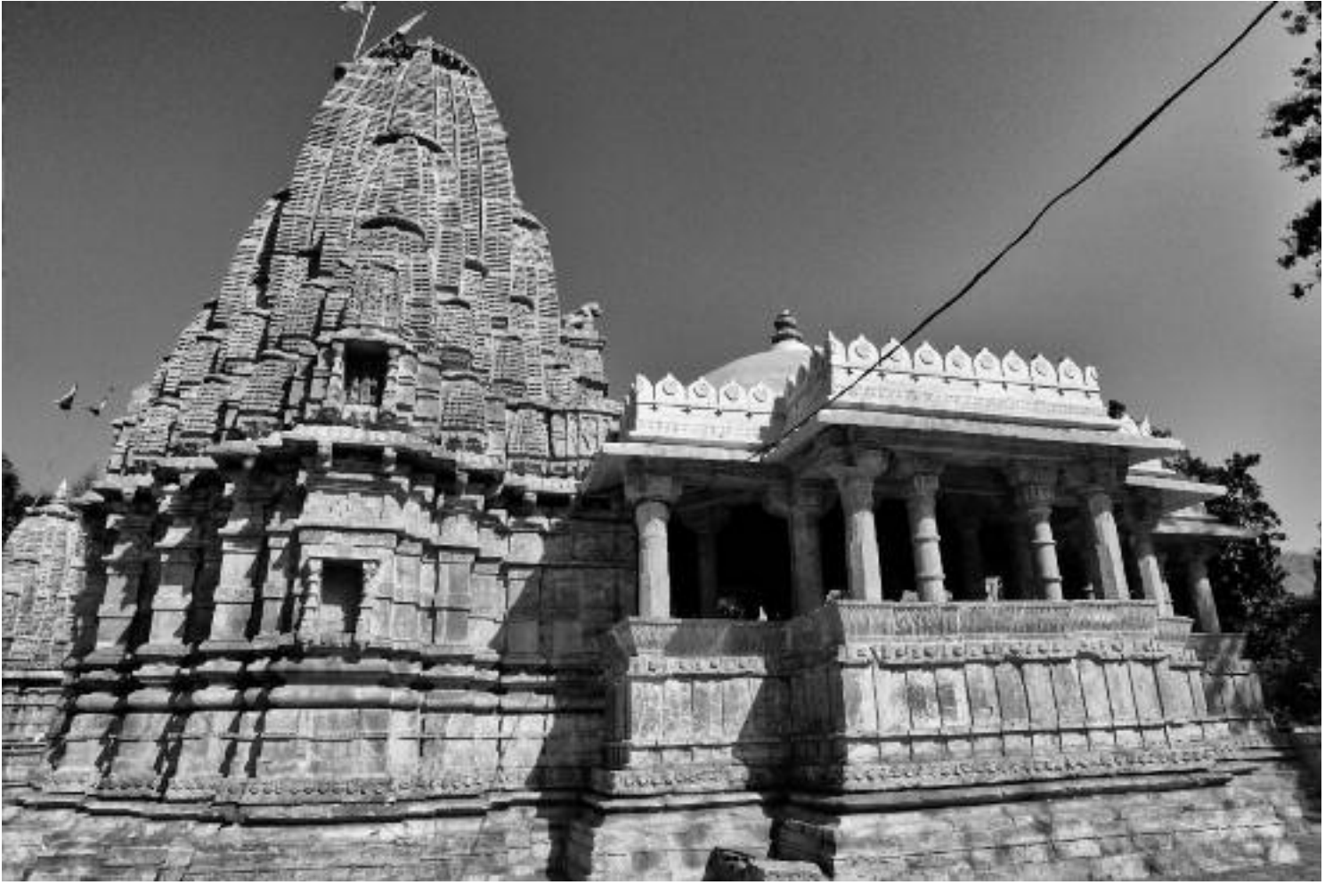
Fig. 9 Ramanatha Temple, stone, 1489 CE. Jawar.