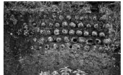
Fig. 3 Zinc retorts, c. 1397, Jawar.