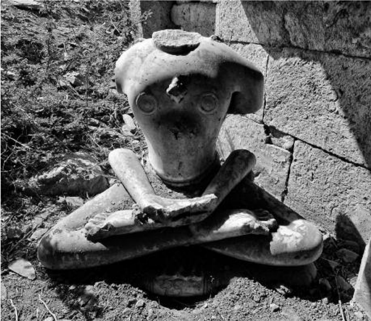
Fig. 5 Jain figure in meditation, stone, 1438 CE. Jain temple 5, Jain temple cluster, Jawar.