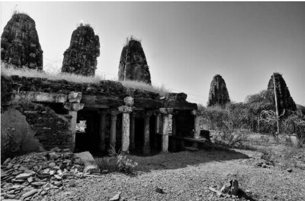
Fig. 8 Tripartite temple, brick, date unknown. Jain temple cluster, Jawar.