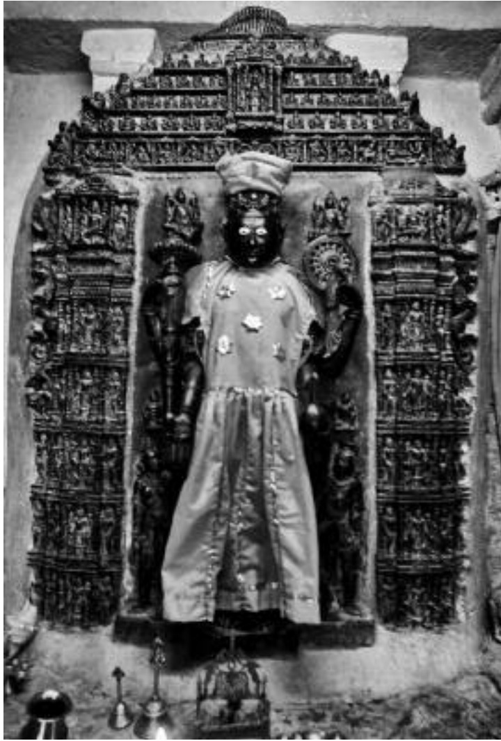
Fig. 10 Ramanatha icon, black schist, c. 1489 CE. Ramanatha temple, Jawar.