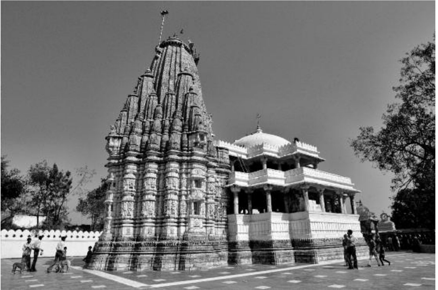
Fig. 12 Jawar Mata temple, stone, c. sixteenth century. Jawar.