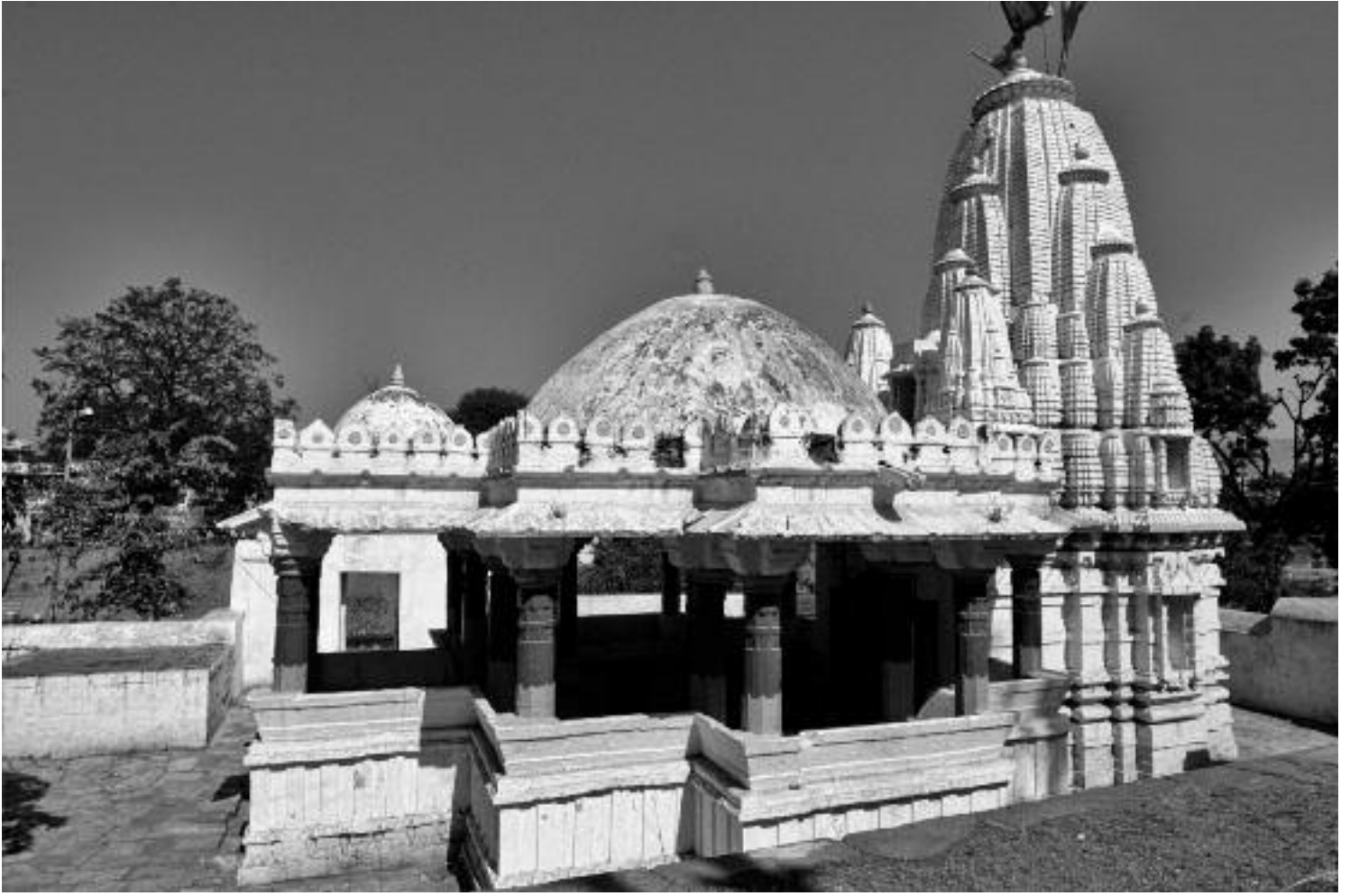
Fig. 13 Śiva temple, stone, date unknown. Jawar.