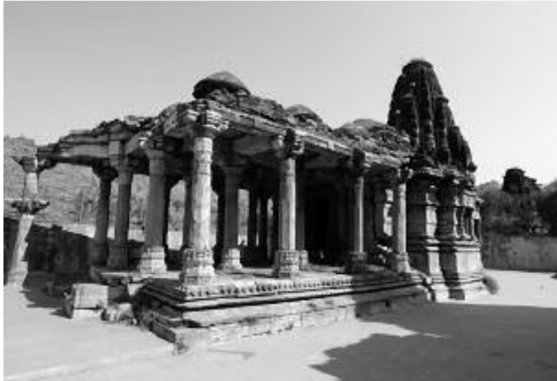
Fig. 7 Shantinath temple, stone, 1421 CE. Jain temple cluster, Jawar.