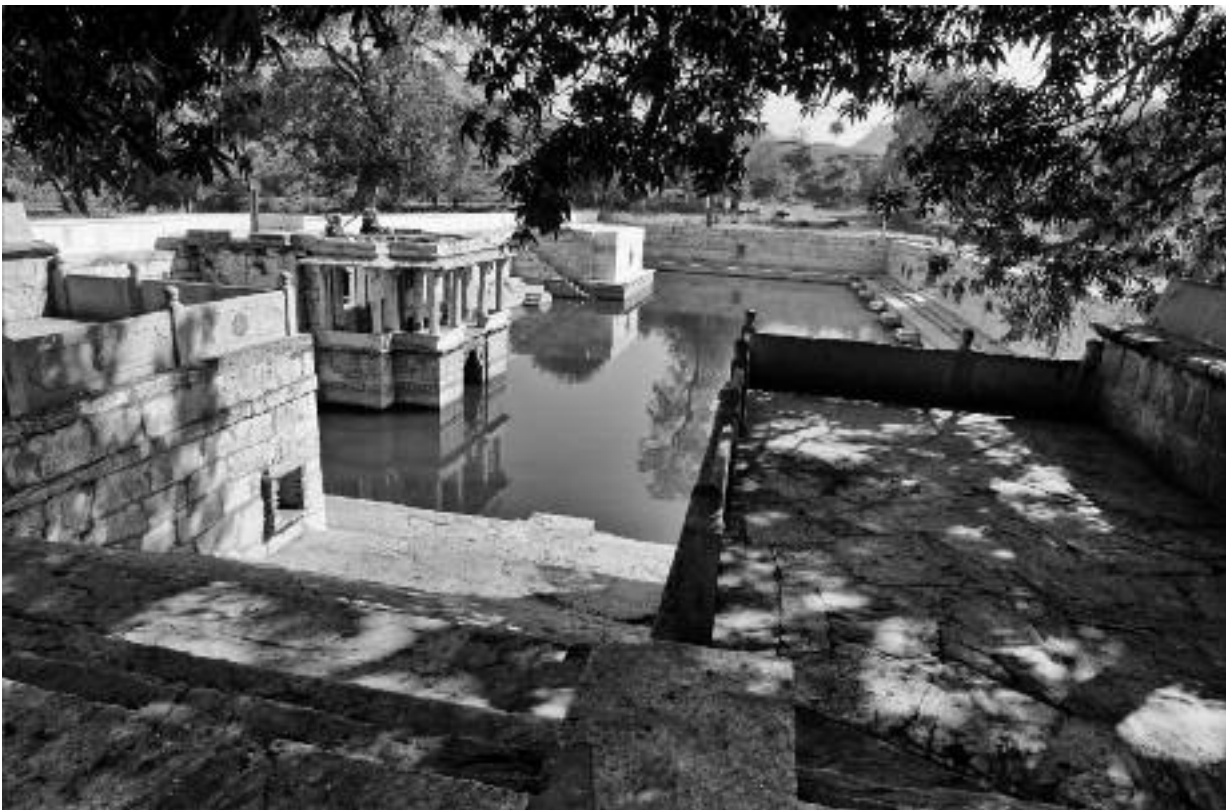
Fig. 11 Tank, 1489 CE. Ramanatha temple, Jawar.