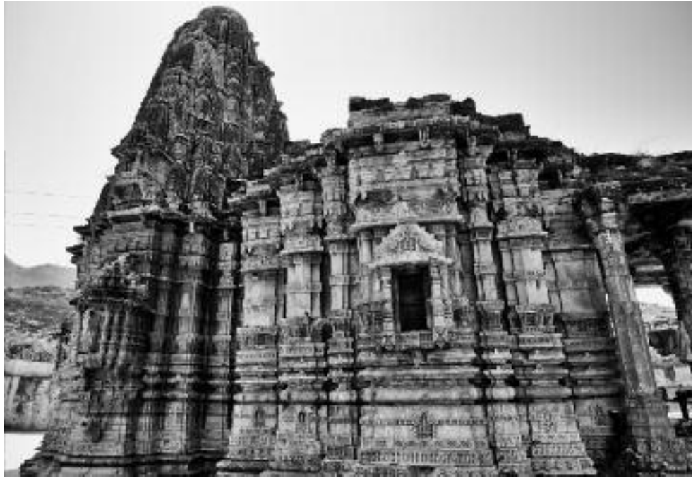
Figs. 6 a–c Jain temple 3, stone, c. 1480s. Jain temple cluster, Jawar.