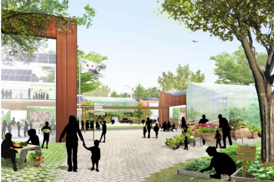
Academy for Global Citizenship Chicago, 2018