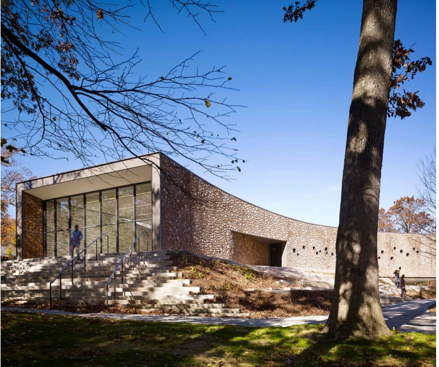
Arcus Center for Social Justice Leadership Kalamazoo, MI, 2014